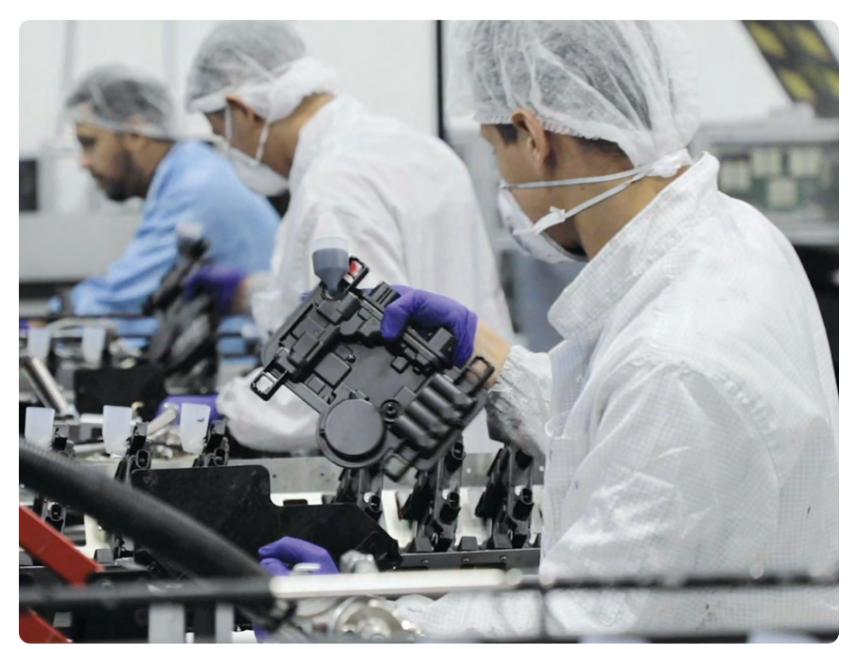
Enphase production line at the Flex Mexico factory

In early March 2020, the worldwide spread of the pandemic resulted in significant downward pressure on global demand due to shelter-in-place restrictions. As a result, we cut our manufacturing targets in Q2'20 and then had to quickly ramp back up to meet the surge in demand in Q3'20 and Q4'20. Our operations team did an excellent job flexing manufacturing as 2020 played out. I am very proud of the fact that our global team was able to navigate the manufacturing and logistics disruptions due to the pandemic in order to meet on-time customer deliveries.