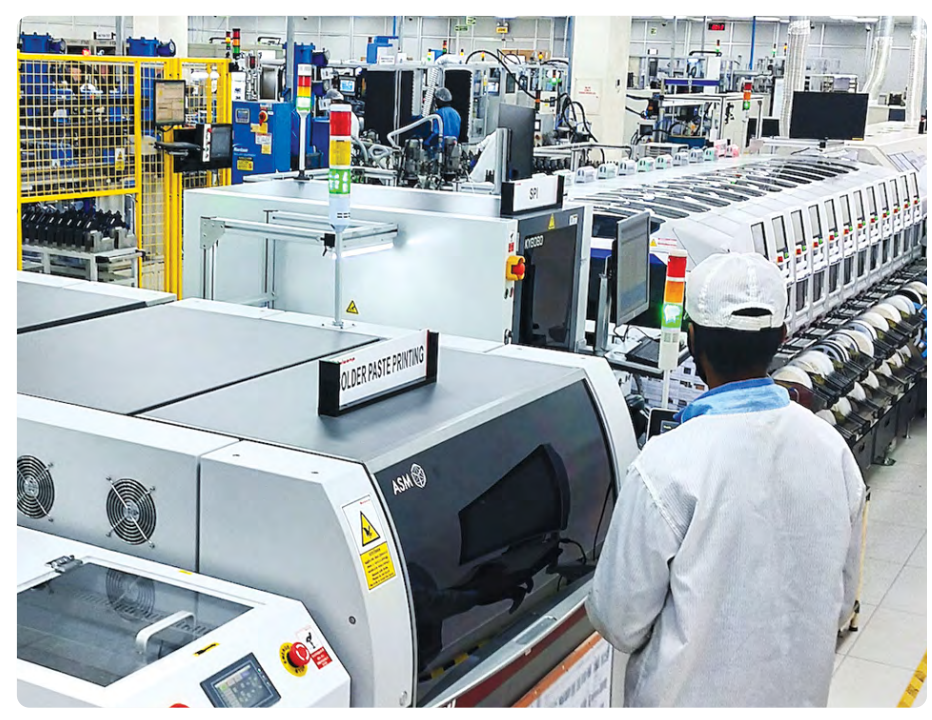
Manufacturing at the Salcomp India facility

I was also pleased with the ramp of our Mexico factory which met our target of producing more than one million microinverters in Q4'20. As part of our supply chain strategy to diversify production to tariff-free and cost competitive locations, we began microinverter production at Salcomp India in October 2020 and started shipping to customers during Q4'20. We have a high-quality, state-of-the-art automated line with a quarterly production capacity of 500,000 units and the space to add a second line with the same capacity. Our goal is to have a global capacity of five million units per quarter by the end of 2021.